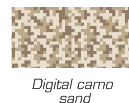
Digital camo sand