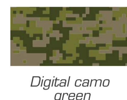
Digital camo green