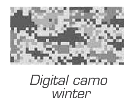
Digital camo winter